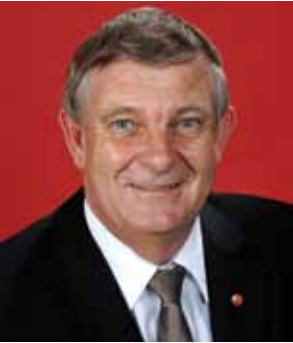
BACK, Christopher John Senator for Western Australia Liberal Party of Australia