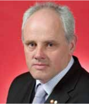
MADIGAN, John Joseph Senator for Victoria Democratic Labor Party