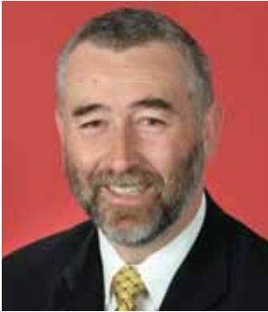
HUMPHRIES, Gary John Joseph Senator for the Australian Capital Territory Liberal Party of Australia