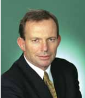
ABBOTT, the Hon. Anthony (Tony) John Member for Warringah (NSW) Liberal Party of Australia